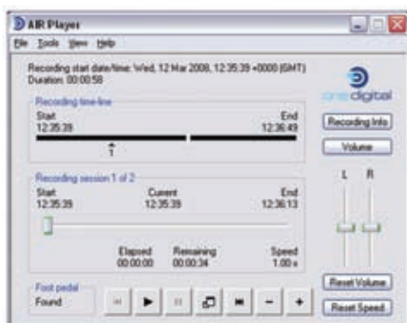
User display interface